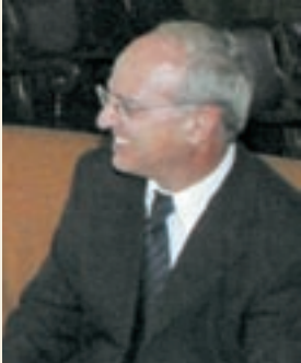
Leandros Nicolaides Chief Inspector and Director of the Department of Labour Inspection Cyprus

In November 2008, the implementation of a project under the framework of the Transition Facility fund of the European Union was completed. The title of the project was "Technical Assistance for the improvement of the capacity of the Cyprus Competent Authority, the Social Partners and the workers of the Construction Industry, Extractive Industry and Dockworks on Safety and Health at Work issues".